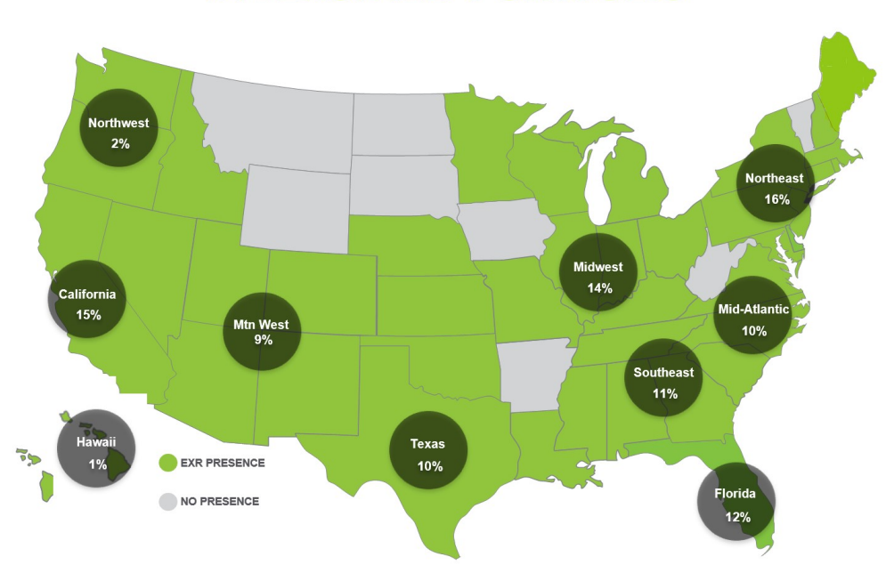
*Weighted by portfolio square footage as of December 31, 2022

As of December 31, 2022, approximately 1,335,000 tenants were leasing storage units at the operating stores that we own and/or manage, primarily on a month-to-month basis, providing the flexibility to increase rental rates over time as market conditions permit. Existing tenants generally receive rate increases at least annually, for which no direct correlation has been drawn to our vacancy trends. Although leases are short-term in duration, the typical tenant tends to remain at our stores for an extended period of time. For stores that were stabilized as of December 31, 2022, the average length of stay was approximately 16.4 months.