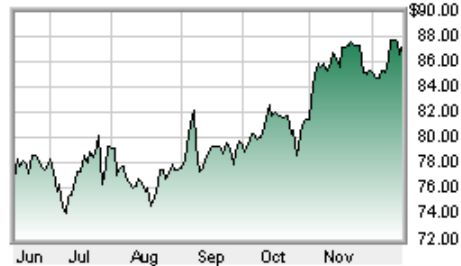
EXTRA SPACE STORAGE INC as of 12/15/2017

Exchange NYSE (US Dollar) Price $87.56 Change (%) ▲ 0.96 (1.11%) Volume 1,542,998 Data as of 12/15/17 4:00 p.m. ET